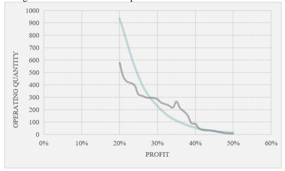
Figure 1 Profit level and profit and loss of youth physical education and training institutions

training institutions are shown in Figure 1. This exposes the common problems in the youth sports training market at present, that is, most institutions are small and micro enterprises, which can only basically maintain the balance of revenue and expenditure and daily operation, and even a small number of training institutions cannot achieve profits